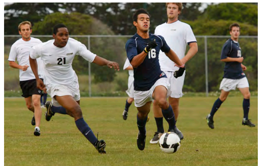
The Athletics and Recreation District will become a cohesive district, with upgrades to existing and additional new facilities for both the Athletics and Recreation programs.