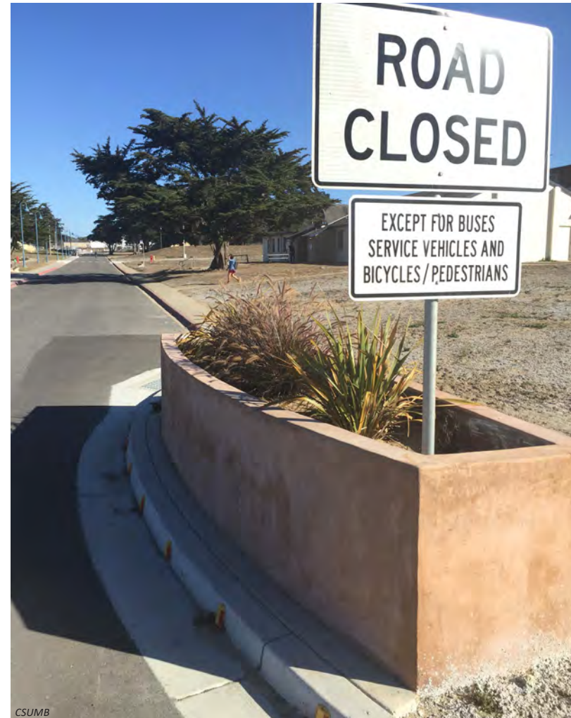
Divarty Mall will become a pedestrian mall, with some similar traits, such as special paving, as the closed portion of Sixth Avenue (above).

Residential open spaces contribute to the quality and character of the Campus residential neighborhoods, and provide areas for socialization and the informal interactions for students. These vary in size from large spaces for recreation and events to more intimate spaces for small group gathering and studying.