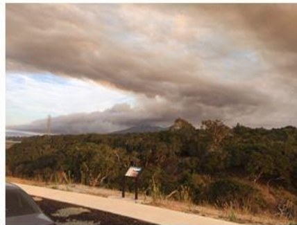
River Fire August 16 th Looking from East Garrison